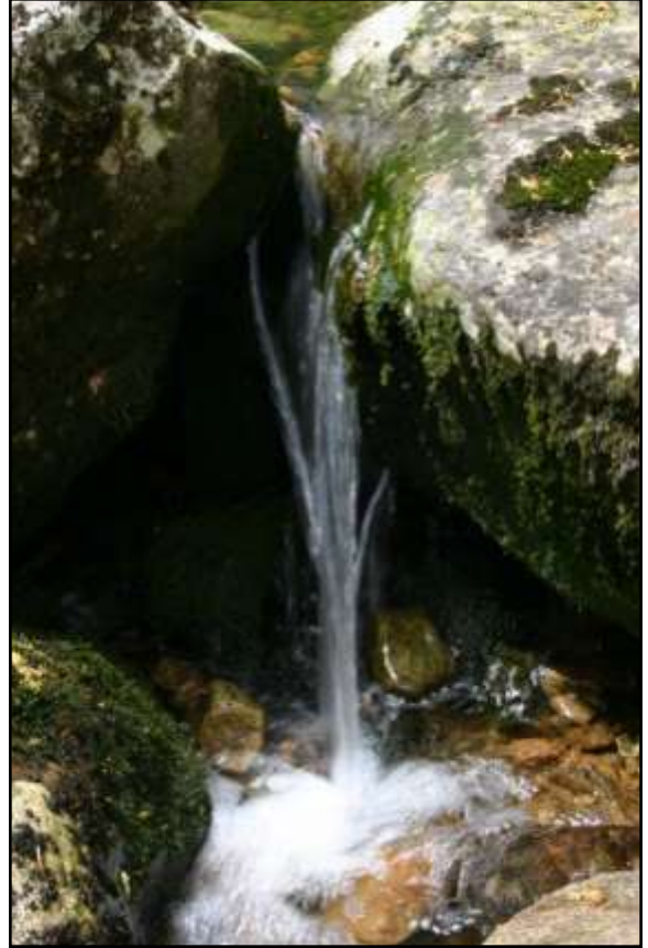
Auger Falls NY