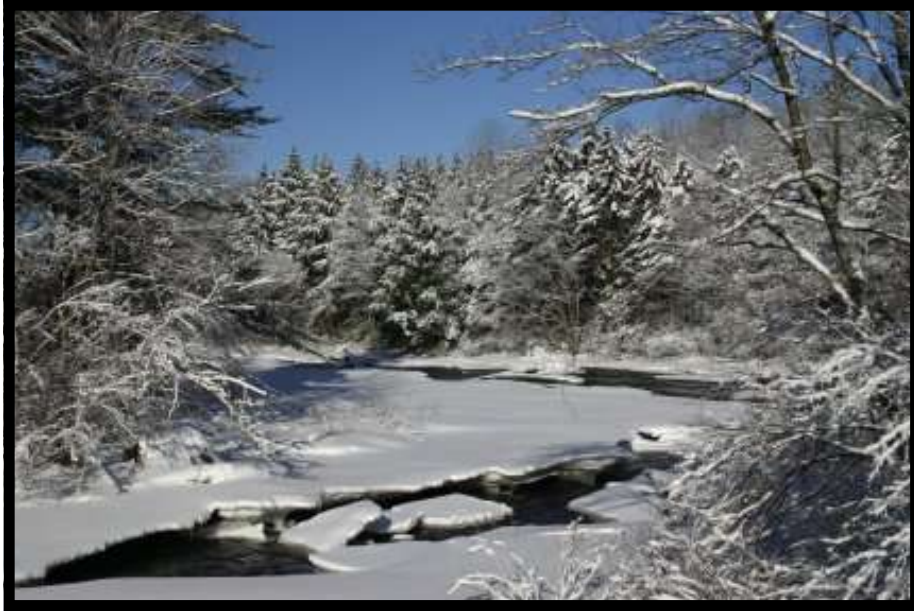
West Canada Creek NY