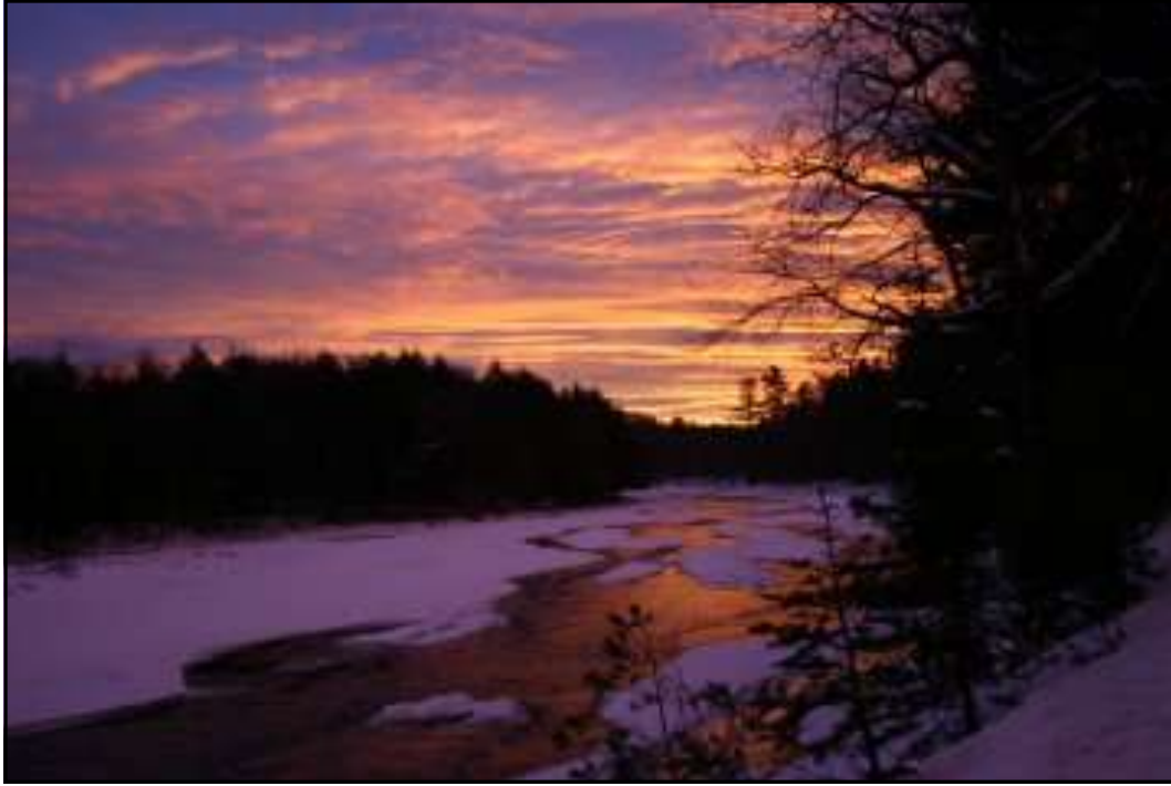
West Canada Creek NY