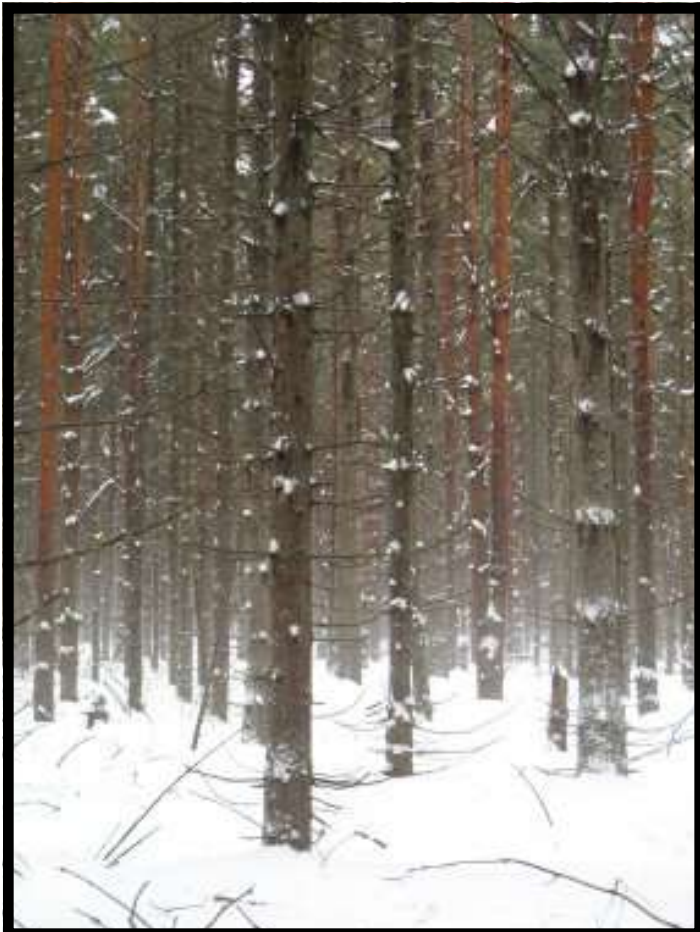
Chimney Mtn NY