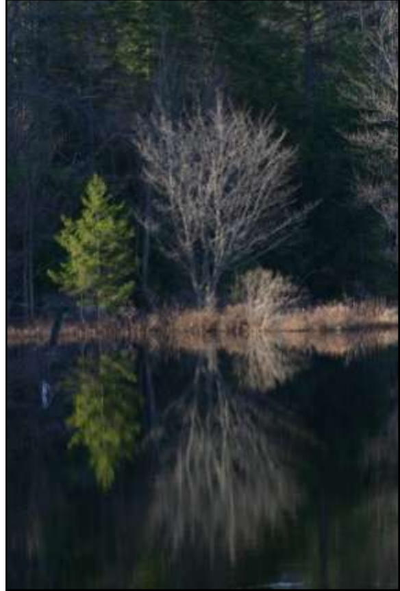
Piseco Lake Outlet, NY