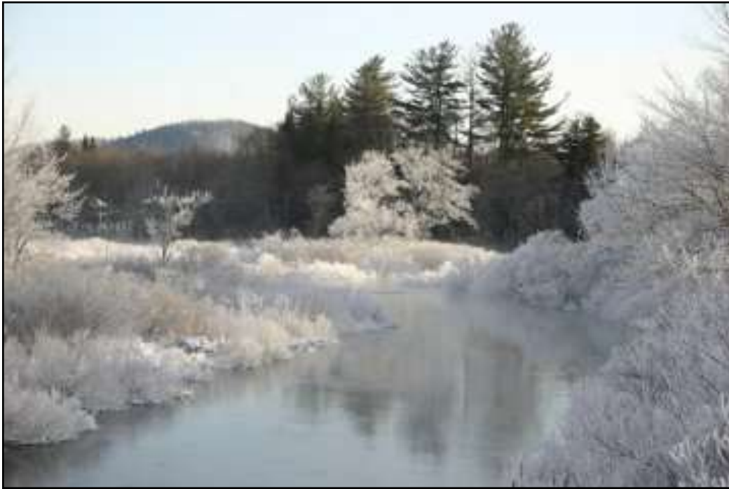
Sacandaga River, NY