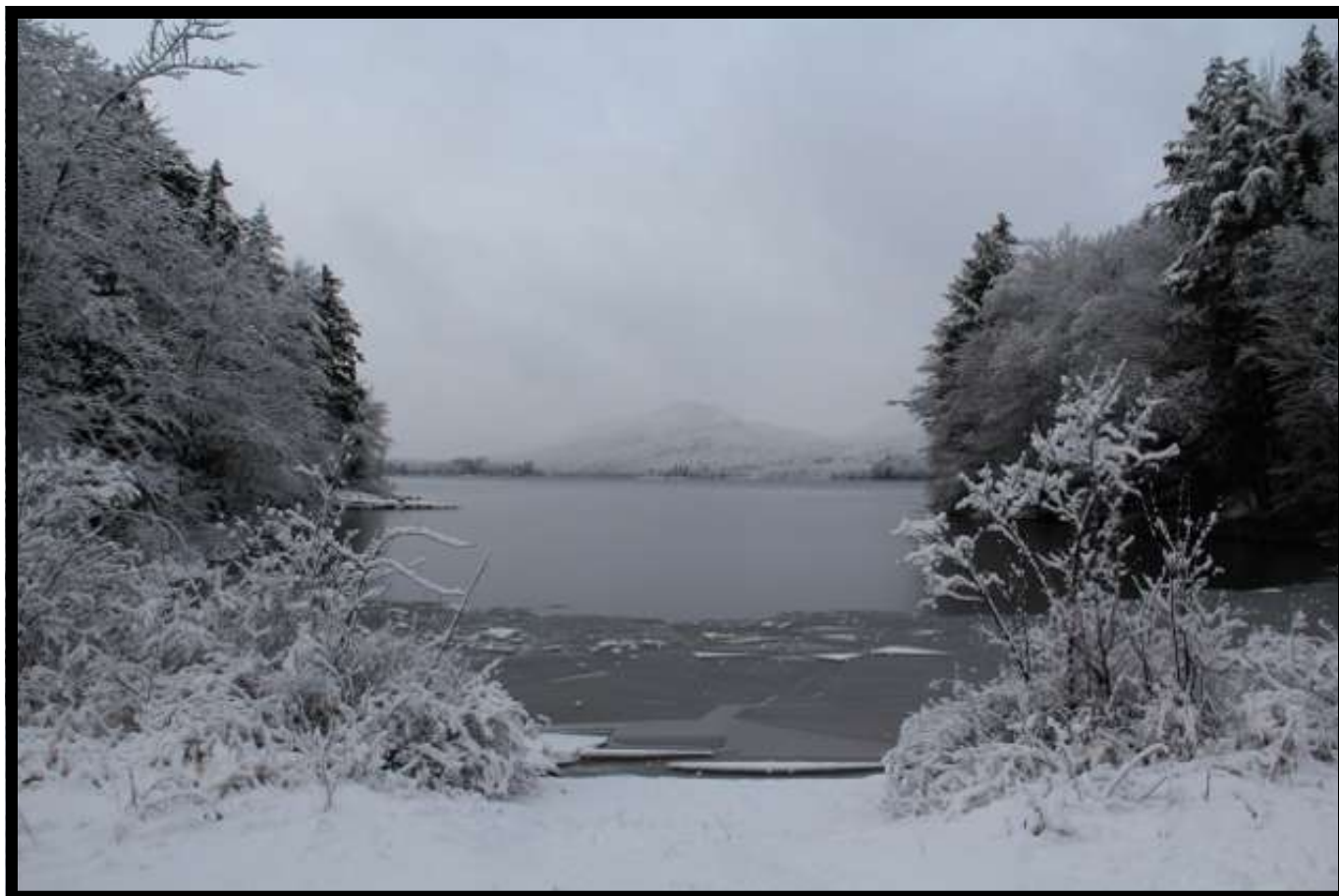
Piseco Lake (bottom)