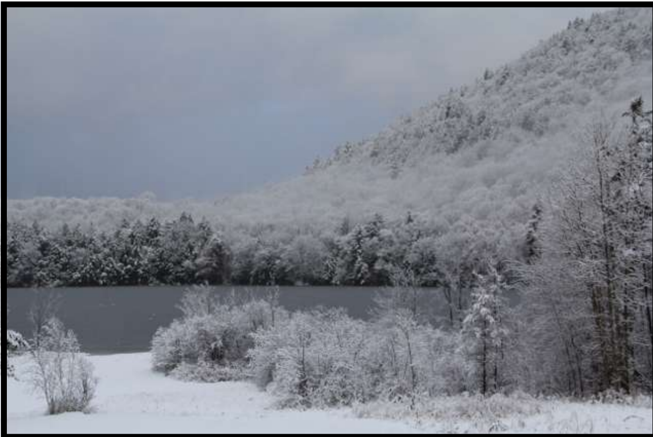
Oxbow Lake (Top)