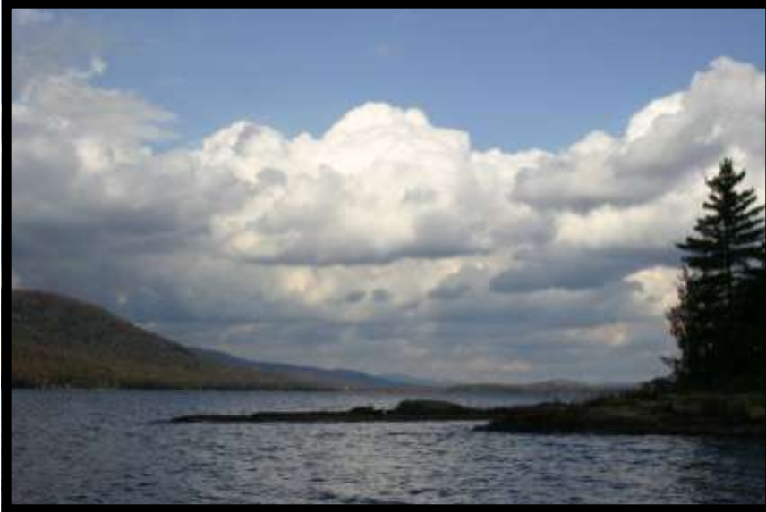
Piseco Lake NY