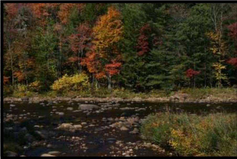
West Canada Creek, NY