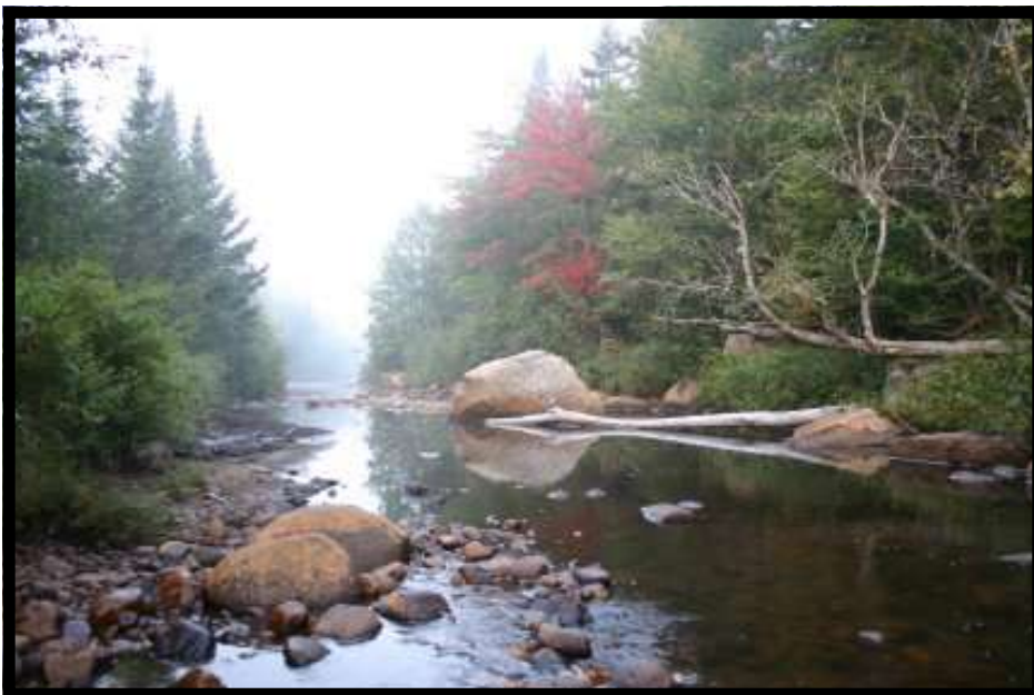
Moose River NY