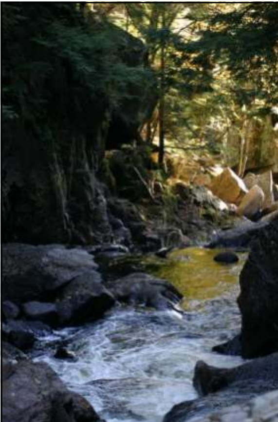
Auger Falls NY