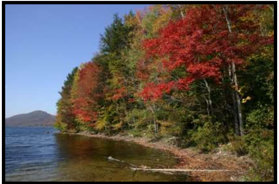
Piseco Lake NY